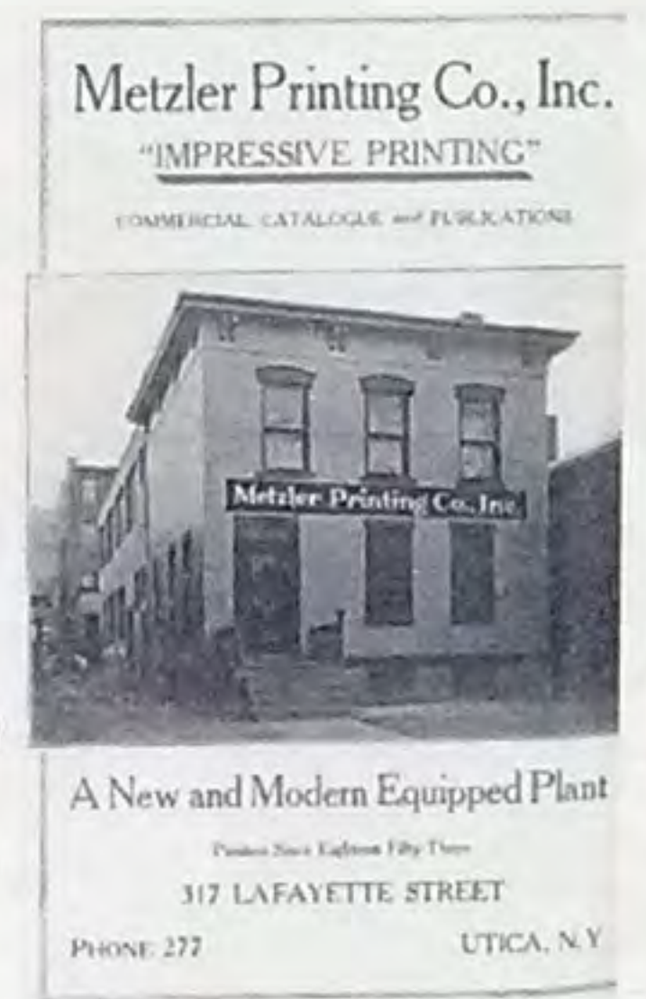
317 Lafayette St.-extant (right)