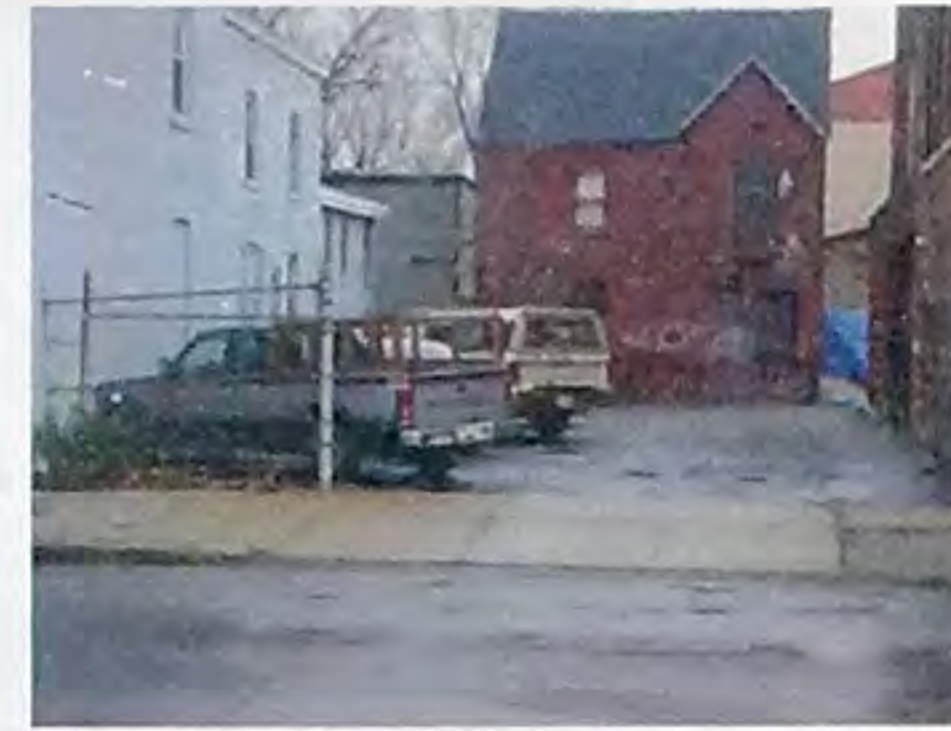
456 Columbia St.- carriage house (above)

An example of a typical mid to late 19th century Utica home remains at 437 Lafayette St. - a brick bracketed Italianate house with carriage house to the rear. Another extant example of this style is the Metzler Printing Co. building at 317 Lafayette St. Such buildings with their accessory buildings provide a glimpse into life on the street over a century ago. In addition, they provide an inspirational blueprint & pattern book as to the character and scale of development that would create an appealing livable environment for the 21st century. Who doesn't like a carriage house apartment?