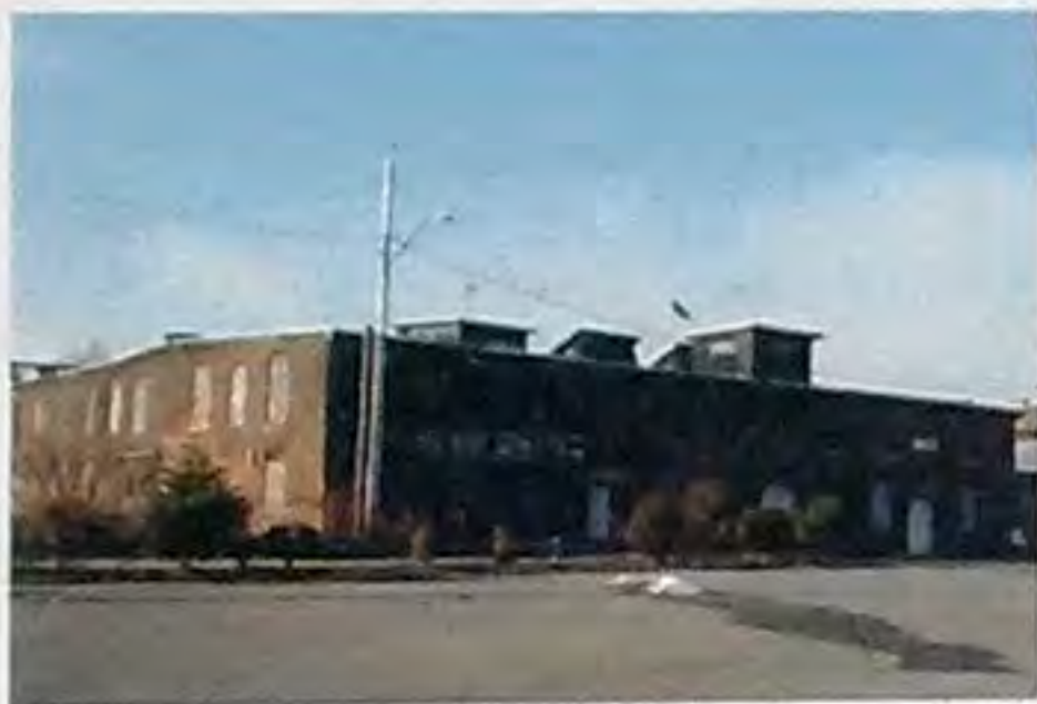
Former Factory buildings 1906 - Carton Ave. -extant