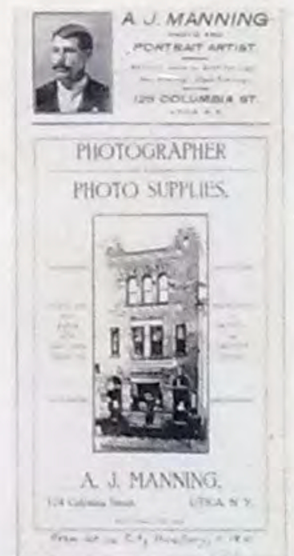
124 Columbia St-1909