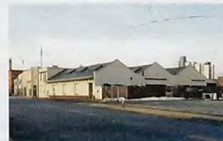
Rear, Trolley garage- extant