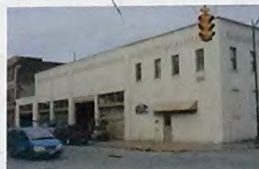
Interurban Trolley Garage- 300 Lafayette St.

1911 St. George's Lithuanian Church opened at 427 Lafayette St.