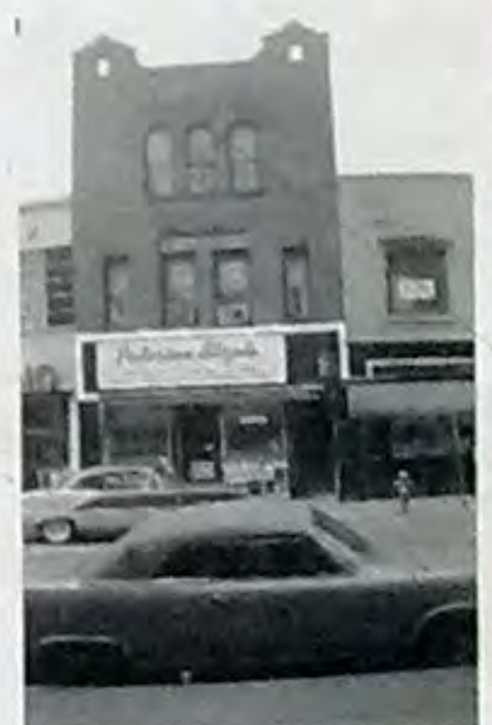
124 Columbia St- 1960's