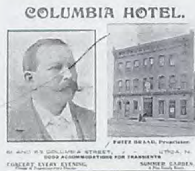
Columbia Hotel ad -1907