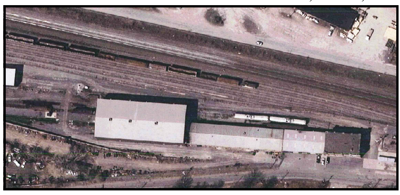
The New York, Susquehanna and Western Railway is offering its Utica, New York Locomotive and Car Repair facility for sale or lease.